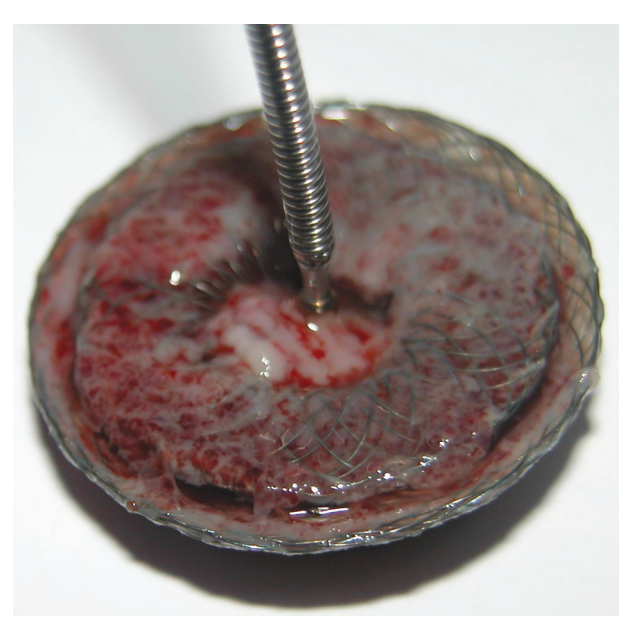
Figure 3. The 28 mm Amplatzer septal occlusion device after extraction.